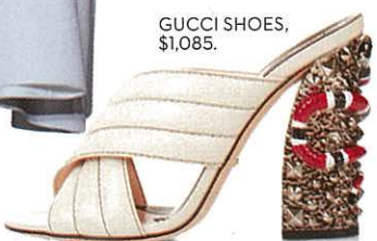
GUCCI SHOES, $1,085.