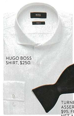
HUGO BOSS SHIRT, $250.

A few finishing polishes are all a contemporary groom needs.