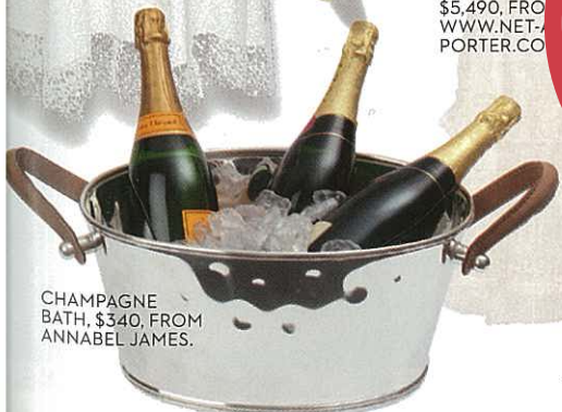
CHAMPAGNE BATH, $340, FROM ANNABEL JAMES.