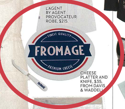
CHEESE PLATTER AND KNIFE, $35, FROM DAVIS & WADDELL