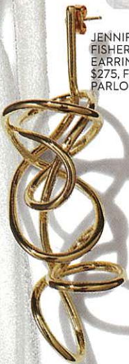
JENNIFER FISHER EARRING, $275, FROM PARLOUR X.