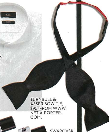
TURNBULL & ASSER BOW TIE, $95, FROM WWW. NET-A-PORTER. COM.