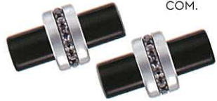
SWAROVSKI CUFFLINKS, $179.