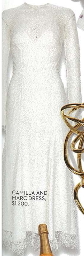
CAMILLA AND MARC DRESS, $1,200.