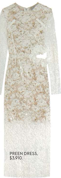
PREEN DRESS, $3,910.