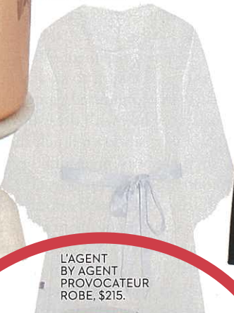
L'AGENT BY AGENT PROVOCATEUR ROBE, $215.