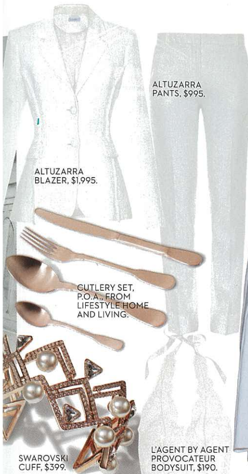
ALTUZARRA BLAZER, $1,995.