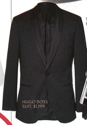
HUGO BOSS SUIT, $1,199.