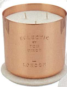
ECLECTIC BY TOM DIXON CANDLE, $125.