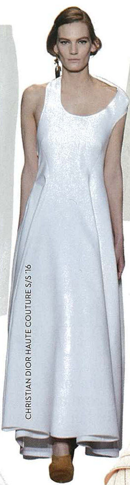
CHRISTIAN DIOR HAUTE COUTURE S/S '16