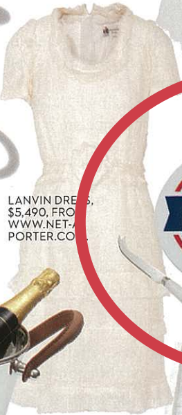
LANVIN DRESS, $5,490, FROM WWW.NET- PORTER.COM