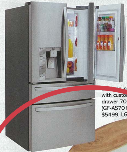
Refrigerator with in-door drawer 701L (GF-AS701SL), $5499, LG.