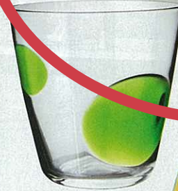
Fabulous handmade glass in Green, $2.99, IKEA.