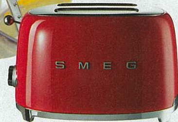
2-slice toaster in Red (TSF01), $179, Smeg.

For shopping details, see Stockists page